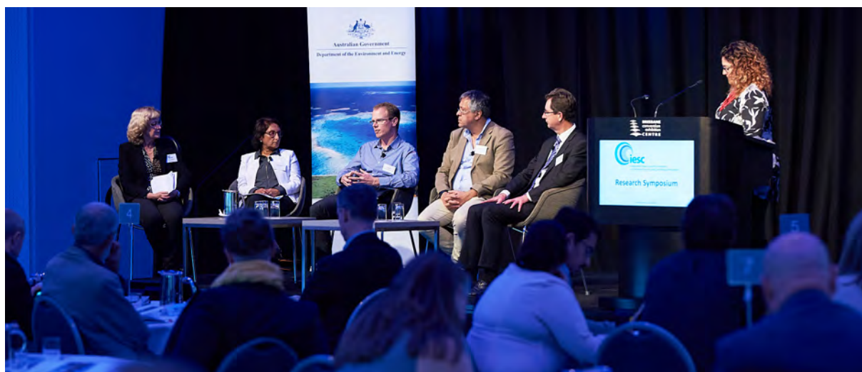
Panel discussion, IESC Research Symposium, Brisbane, Queensland

The Committee hosted two roundtable discussions on updates to the IESC Information Guidelines and the new explanatory notes. The discussion with industry and industry consultants provided valuable context on how proponents apply the Information Guidelines.