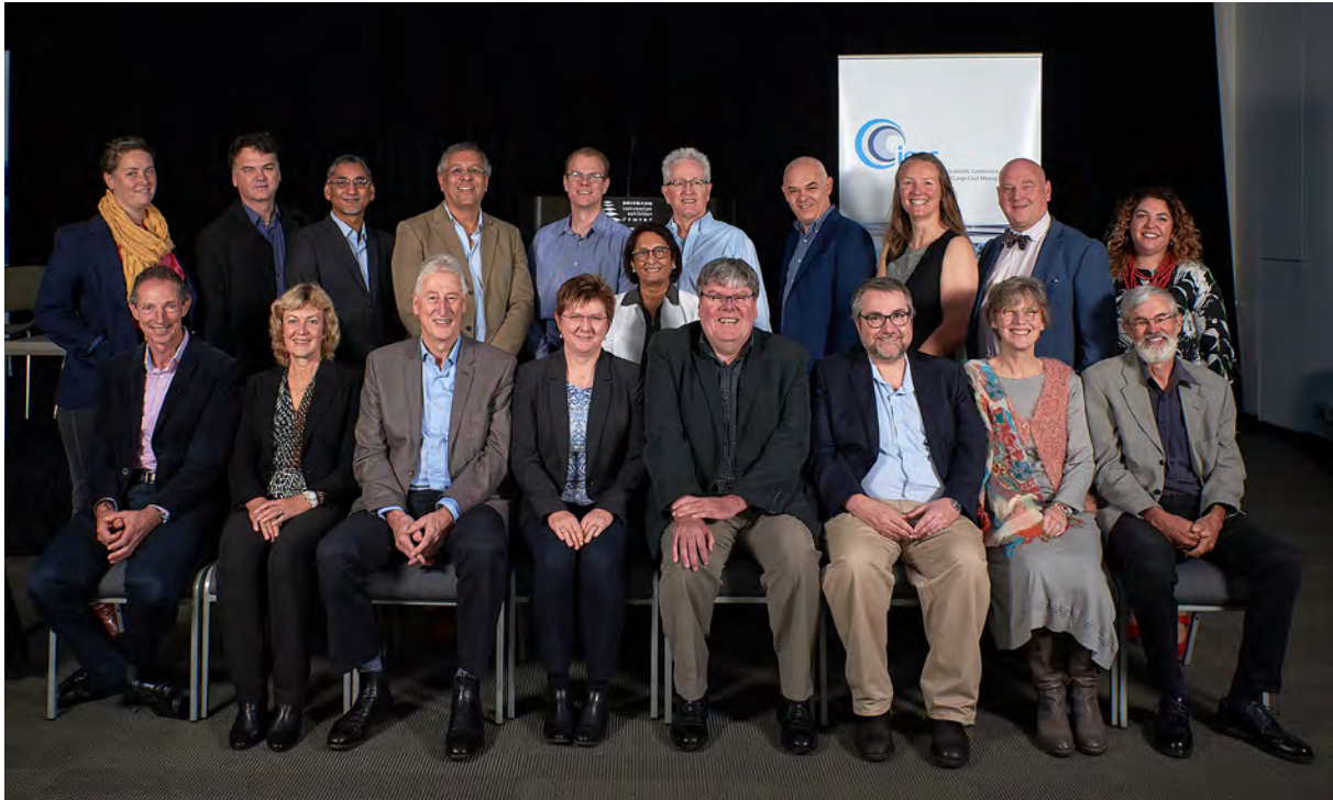
Presenters and Panel Members, IESC Research Symposium, Brisbane, Queensland