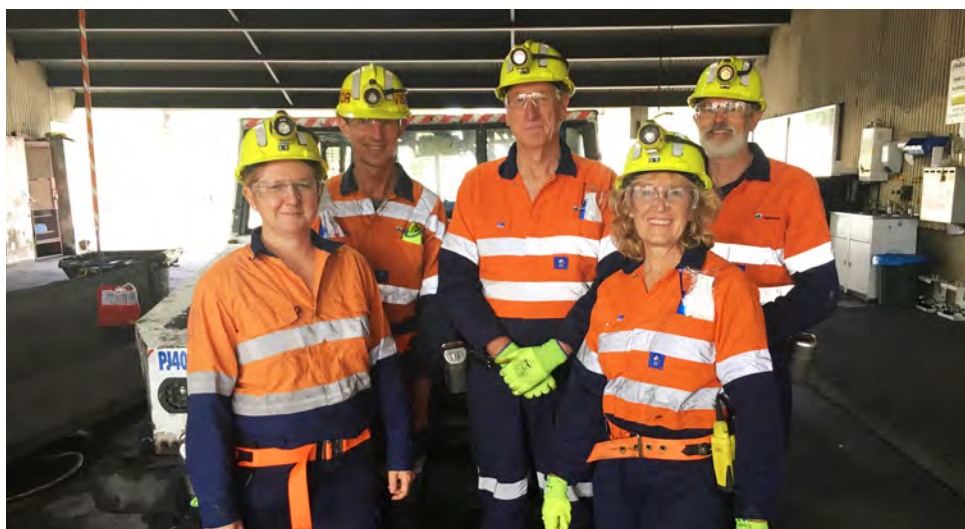
IESC at Mandalong Underground Coal Mine, Morisset, New South Wales

Members had the opportunity to go underground, where they observed a continuous miner (a mining machine that produces a constant flow of ore from the working face of the mine) both cutting coal and installing roof and rib bolting in action and heard how issues such as subsidence (localised lowering of the land surface) were being managed on site.