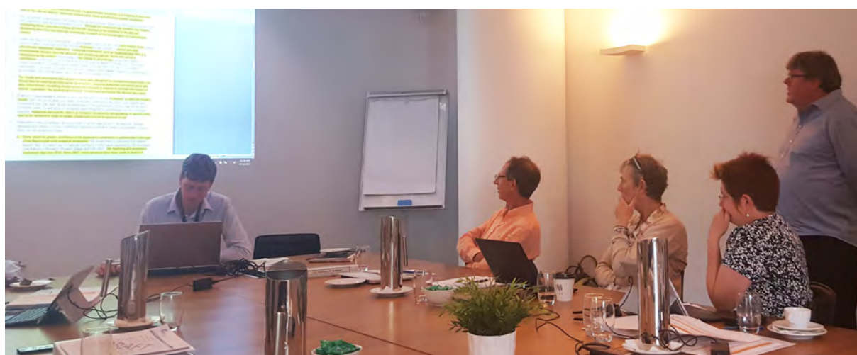
IESC members, Barton, Canberra

This note summarises how to implement the Australian and New Zealand Guidelines for Fresh and Marine Water Quality in designing appropriate monitoring programs for physical and chemical parameters. It includes guidance on how to use monitoring data to develop site-specific guideline values for water and sediment quality.