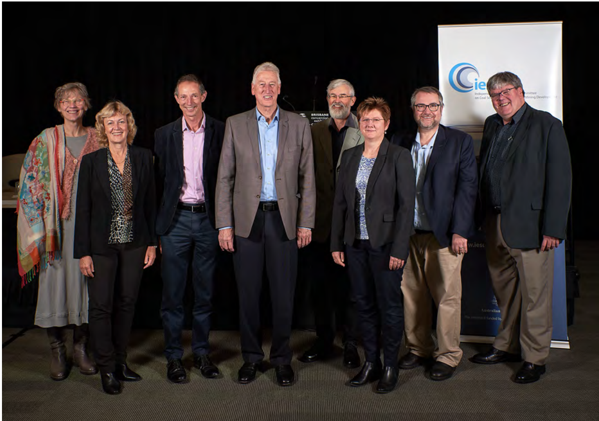
IESC Research Symposium, Brisbane

The Committee consists of eight members, appointed on a part-time basis by the Australian Government Minister with responsibility for the environment. Each member has extensive scientific qualifications and expertise in geology, hydrogeology, hydrology, ecology or ecotoxicology.