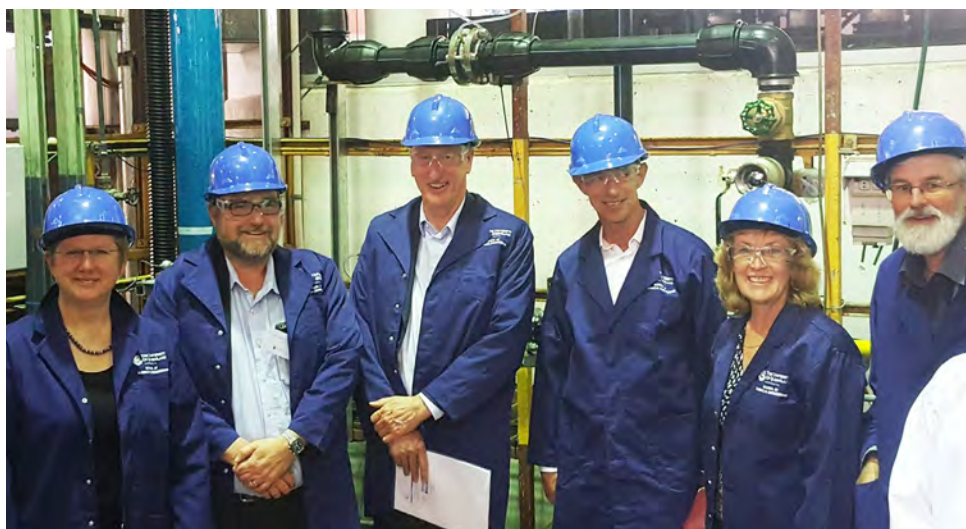
IESC visit the University of Queensland's Centre for Coal Seam Gas, University of Queensland, St Lucia, Queensland

The visit included a lab tour in the School of Chemical Engineering to see its new high-pressure well simulator facility for plugging oil and gas wells, and a demonstration of the large-scale experimental well bore for investigating and measuring gas and water flows and how they interact.